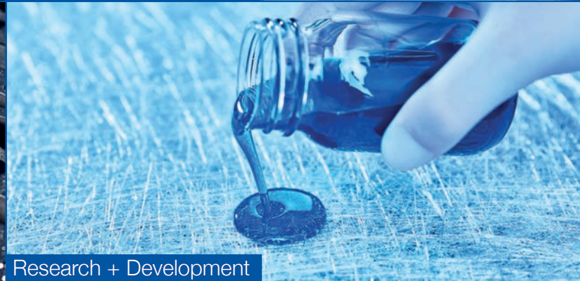
Research + Development