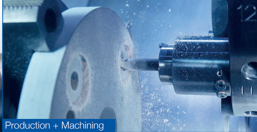
Production + Machining