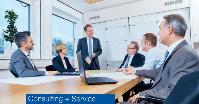
Consulting + Service