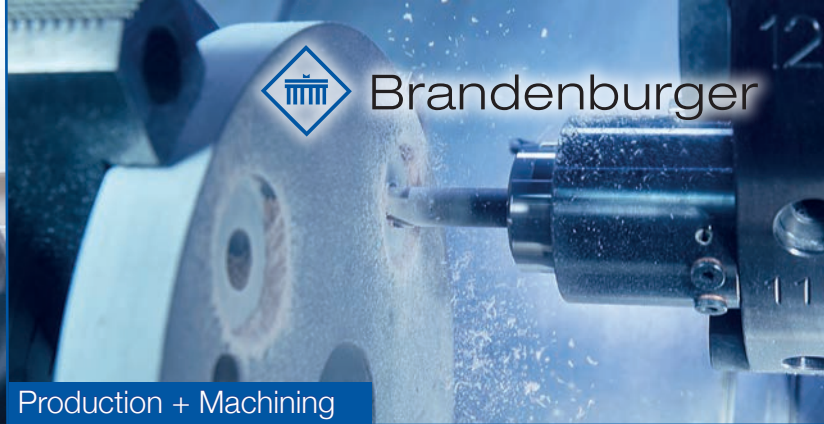
Production + Machining