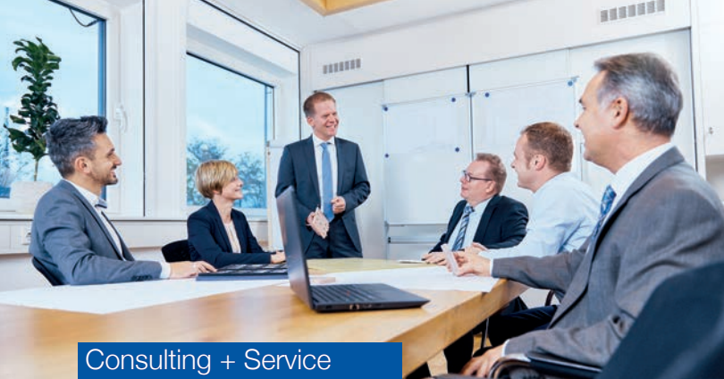
Consulting + Service